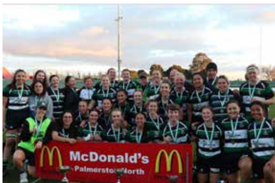
Women's Senior – 1st Club Award – Team of the Year