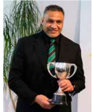
Slade Sturmey Club Award – Coach/ Administrator of the Year