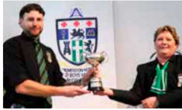
Bron Trubshoe Men's Senior 2nd Best Back