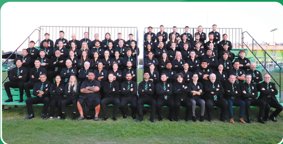
Marist OMB Teams