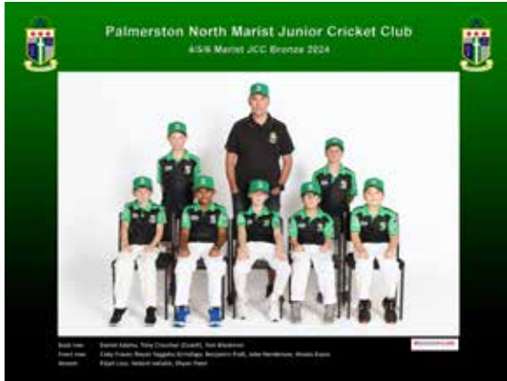
Marist 4/5/6 JCC Bronze