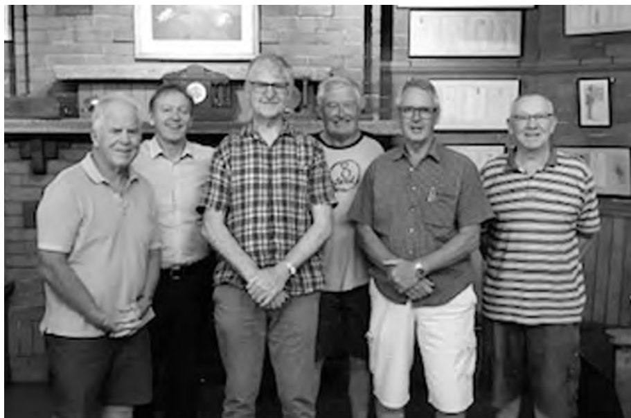
Trustees of The Shamrock Club

The 2019 St Patrick's function took the form of a lunch which celebrated the opening of the renovated clubrooms as well as the presentation of the annual Marist Sports Club awards. We are always pleased to see so many sponsors attending with club officials.